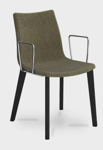
BOKK Four Leg - Available with/without arms

Option W H SD SH 1 465-470 850 420 500 User Weight capacity: 120kg