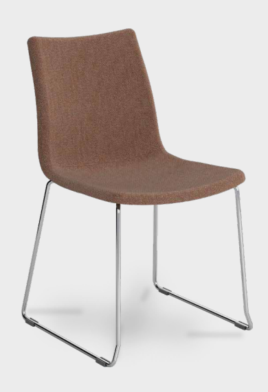
BOKK Slides - Available with/without arms

Option W H SD SH 1 465-470 850 420 500 User Weight capacity: 120kg