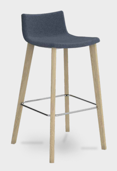
BOKK Stool - Foot rail as standard

Option W H SD SH 1 465 810-945 420 415-550