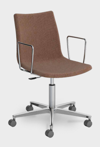
BOKK 5 Star Base - Available with/without arms

Option W H SD SH 1 465 810-945 420 415-550