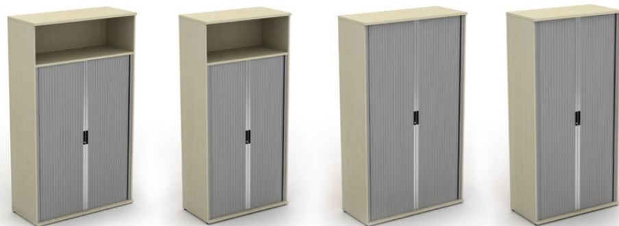
1200mm & 1000mm wide open tambour units

(available as 2062mm, 1657mm, 1252mm, 847mm & 725mm high)