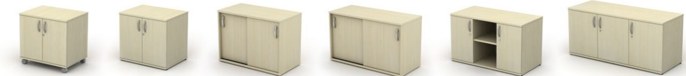
600mm deep mobile cupboard