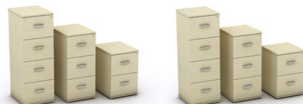
600mm deep filing cabinets (4, 3 or 2 drawers)