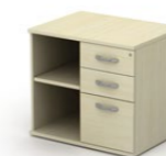
combination open unit