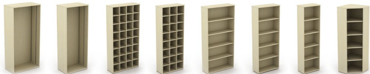
1000mm & 800mm wide open units