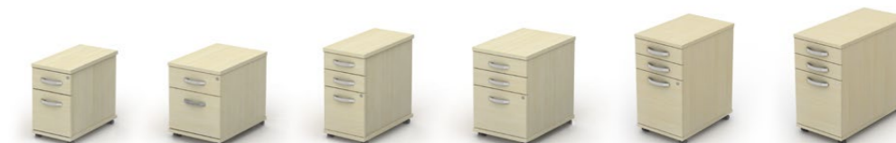
narrow mobile pedestals