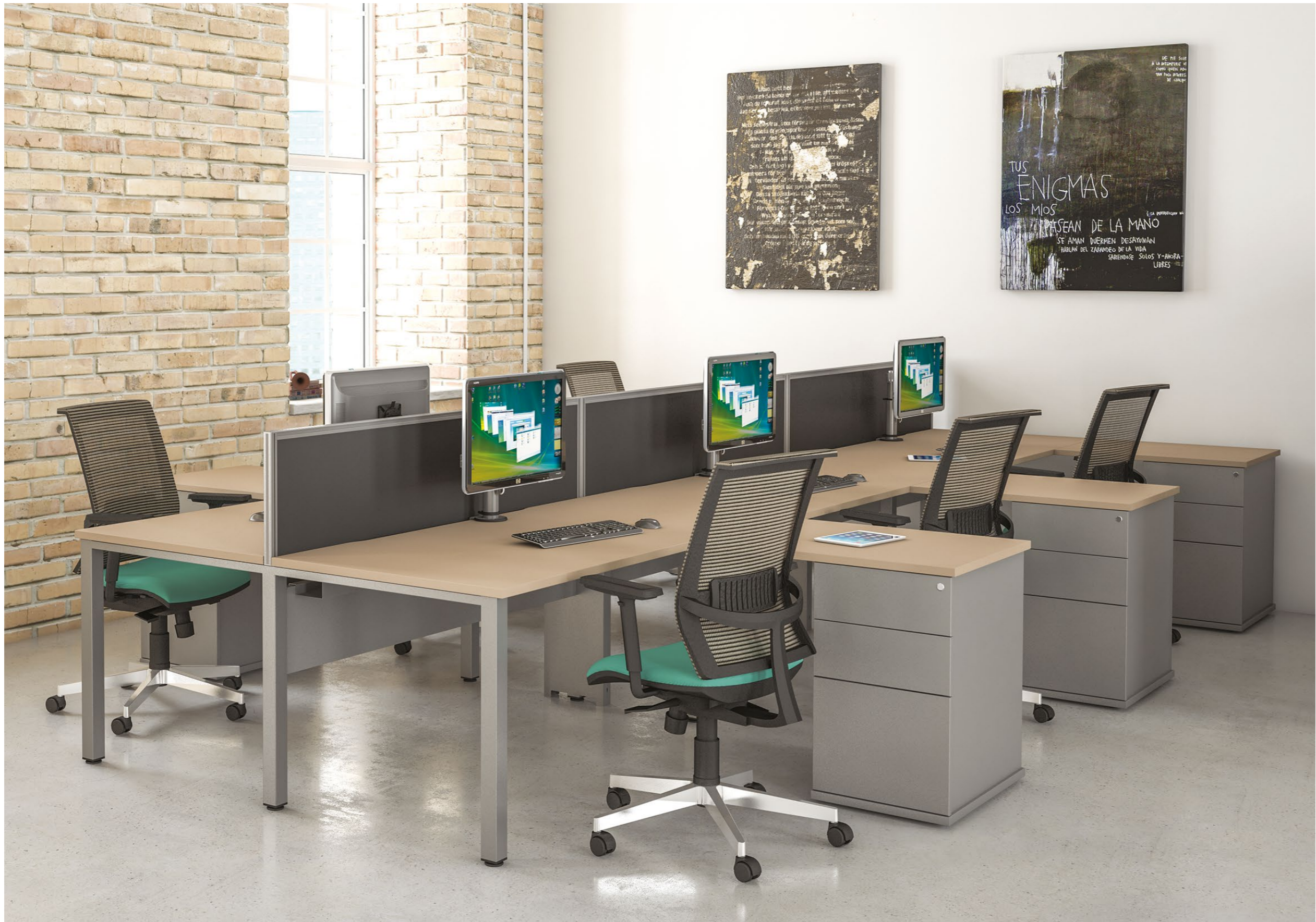
As an alternative to the standard wood grain desk finish, Mocha is ideally suited to complement all three Pure Bench trim colours

Pure Bench has all the characteristics of a modern bench system . Leg sharing capability, extension frames, shared cable management and frame mounted screens, allowing Pure Bench to be a competitive alternative to iBench.