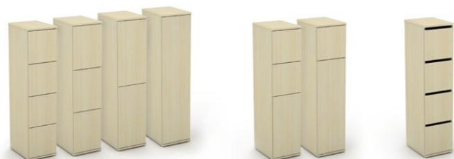
personal lockers available with various door options

(choice of 2, 3, 4 or a single door option)