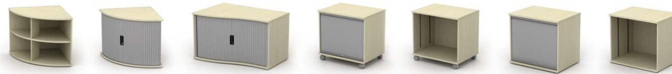
radial end open storage