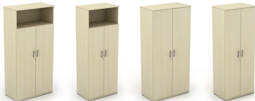
1000mm & 800mm wide open cupboards

(available as 2062mm, 1657mm, 1252mm, 847mm & 725mm high with a choice of handle)