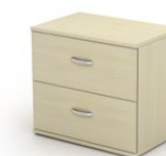
525mm & 600mm deep side filers