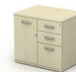
combination cupboard unit